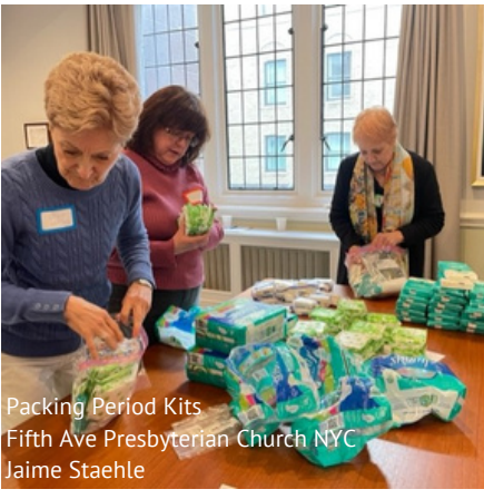
Matthew 25 continues to be a guiding force in the work of PDA.