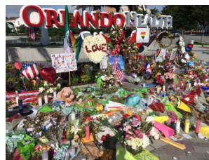
Orlando shooting