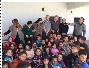
Syrian refugee school children