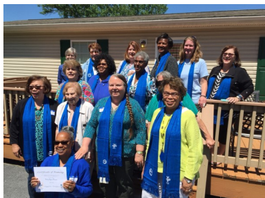
PW trainers from Synod of the Mid-Atlantic

In 2015, PDA began a collaboration with Presbyterian Women (PW) to help congregations and presbyteries prepare for disasters. Members of the NRT designed a curriculum for disaster preparedness and plan to train members of PW from each presbytery in the U.S. So far, there are 93 trainers in 43 presbyteries in 22 states. To inquire about future trainings, email pda@pcusa.org