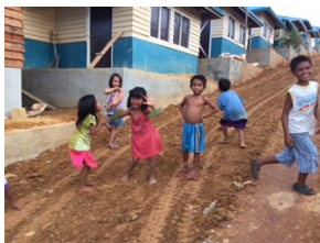
Filipino children in Barangay Ferras

Nationally , your gifts supported response to natural and human-caused disasters in 29 states . Your gifts supported: