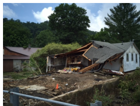
WV flood