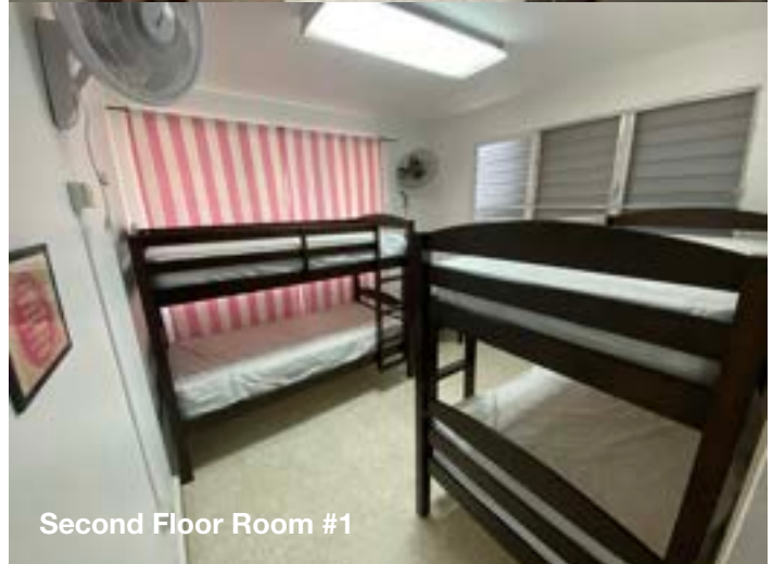
Second Floor Room #1