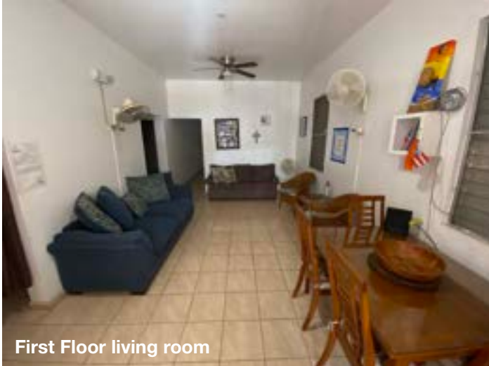
First Floor living room

Floor 1: 2 rooms with 1 bunk bed each (bottom bed full size)