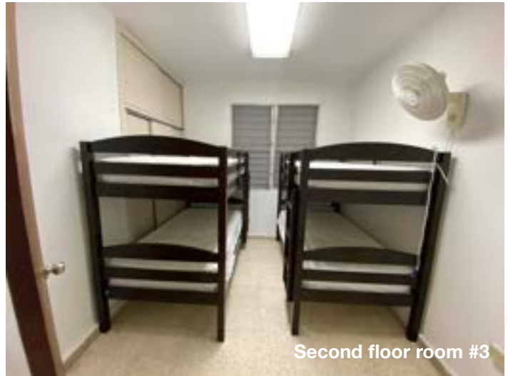
Second floor room #3