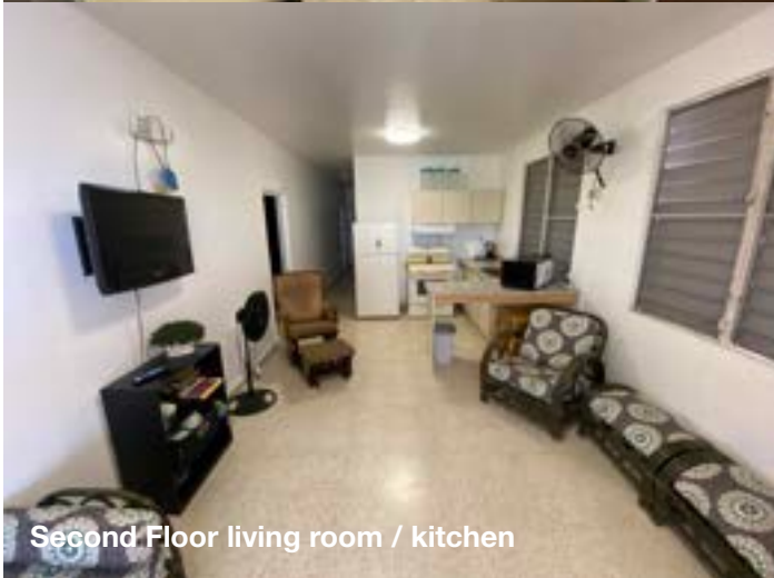
Second Floor living room / kitchen