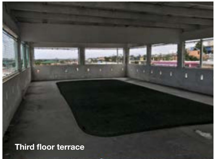
Third floor terrace