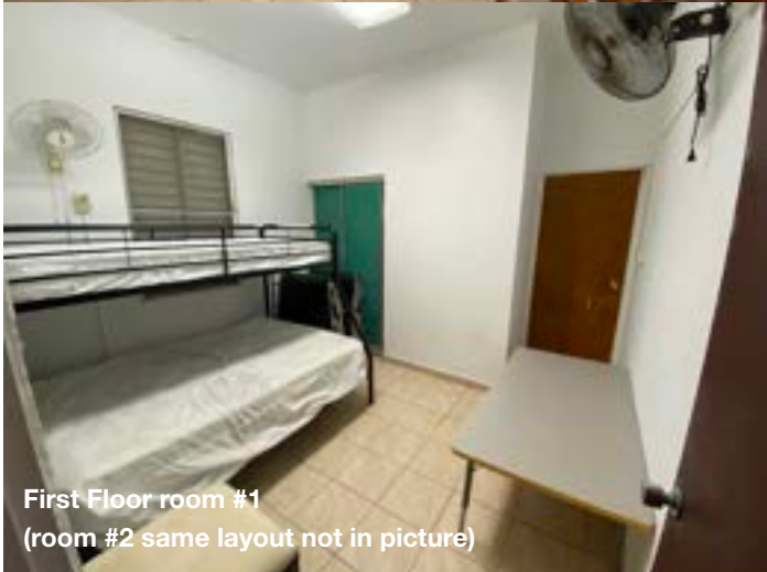
First Floor room #1 (room #2 same layout not in picture)