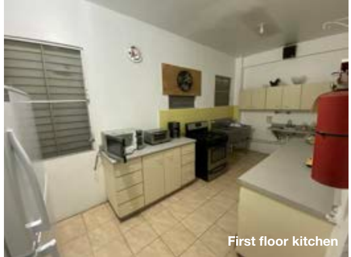
First floor kitchen