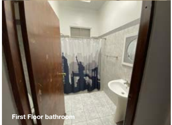
First Floor bathroom