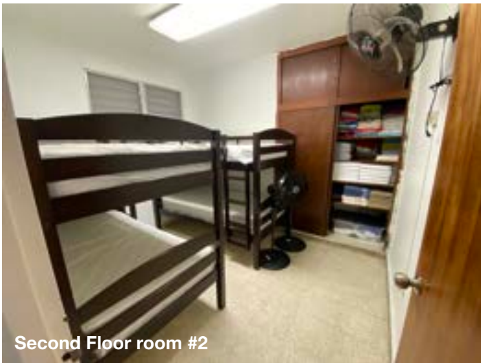
Second Floor room #2